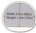
Cross Section Fokker F27-600